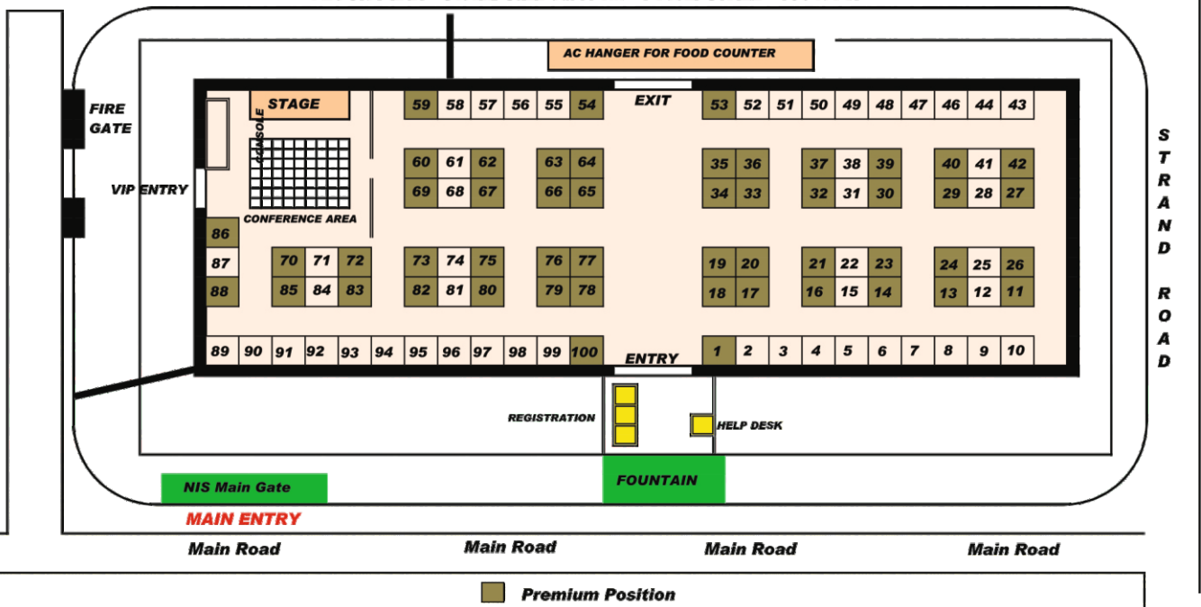
FLOOR PLAN - STALL SIZE 3M X 3M - TOTAL STALL - 100 NOS.

* Taxes, as applicable. @ 10% Surcharge for Corner location of Shell Scheme Stand is chargeable. # 10% Loyalty benefit for Members of Bharat Chamber of Commerce.